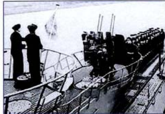
U-869's crew assembles on deck (1944)

Destroyed with depth charges on February 11 1945 by USN HOWARD D. CROW and USN KOINER. The destroyer escorts were with Transatlantic Convoy CU-58 when, at 1639 ships time, sonar detected a target at position roughly 39.30N 72.58W. After the attack with hedge-hogs and depth charges, oil and air bursts came to the surface. However, the kill was not confirmed until the wreck was found by divers off New Jersey in 1991 and identified in 1997. None of the 56 crew members had survived.