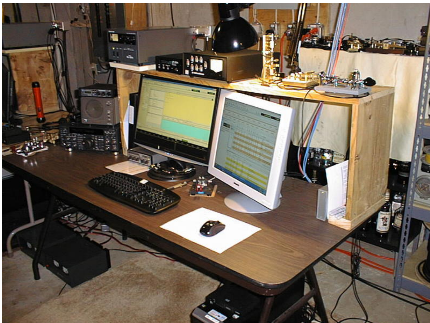
RF Wattmeter / THP HL1.2Kfx amp / Bencher paddle

Radio 2 - TS-870s / Tokyo Hy Power HL1.2Kfx / LP-100A Digital Vector RF Wattmeter / Navigator interface / 3.2Ghz pentium 4 computer Using HRD/DM780 software / LDG AT-1000Pro tuner / Tmewave 599zx DSP audio filter / Brown Brothers paddle