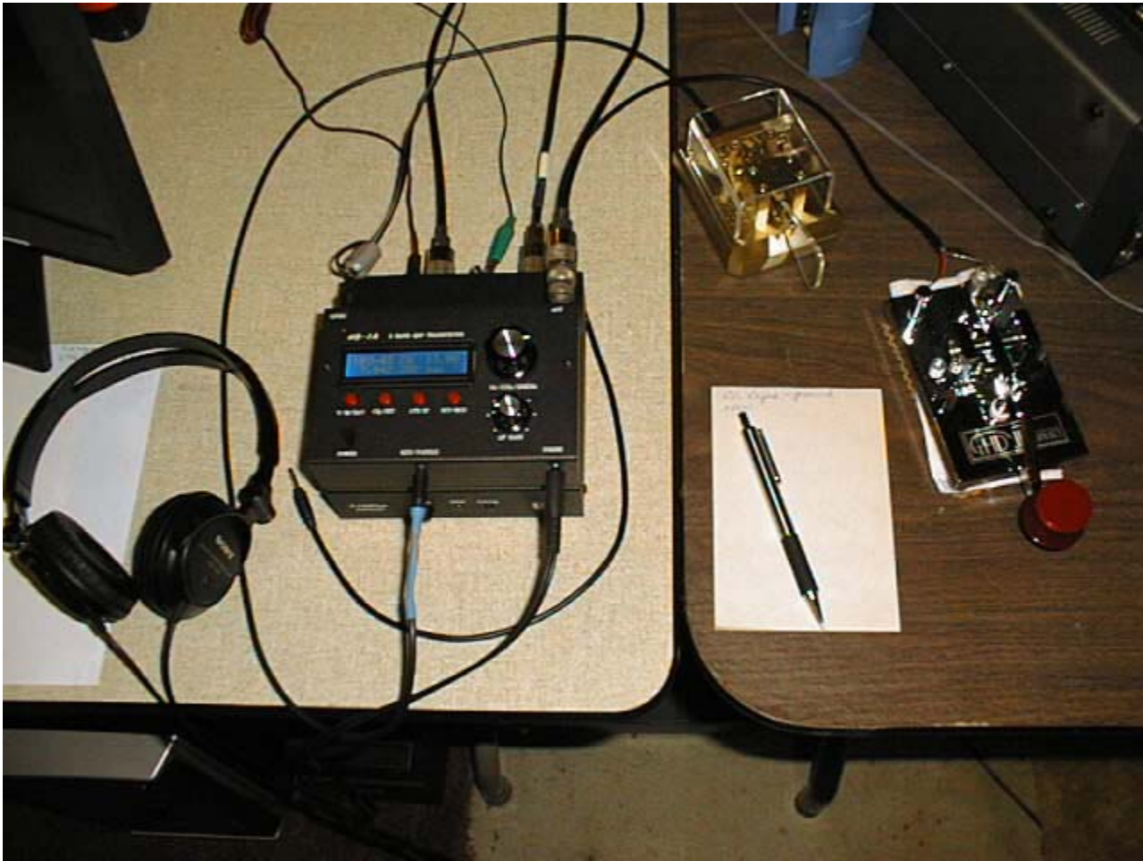
Radio 7 QRP Chinese version HB-1A 3 band transceiver / LDG Z-100 plus autotuner / GHD GT-502 mil Straight key / Scheunemann SP-2 Single Lever paddle