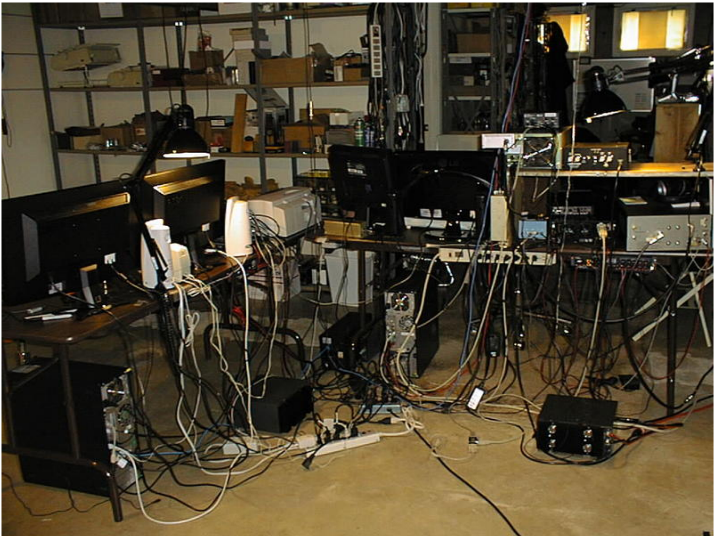
-----My Wireless-----Radio 5 (L) and Radio 3 (R)-----