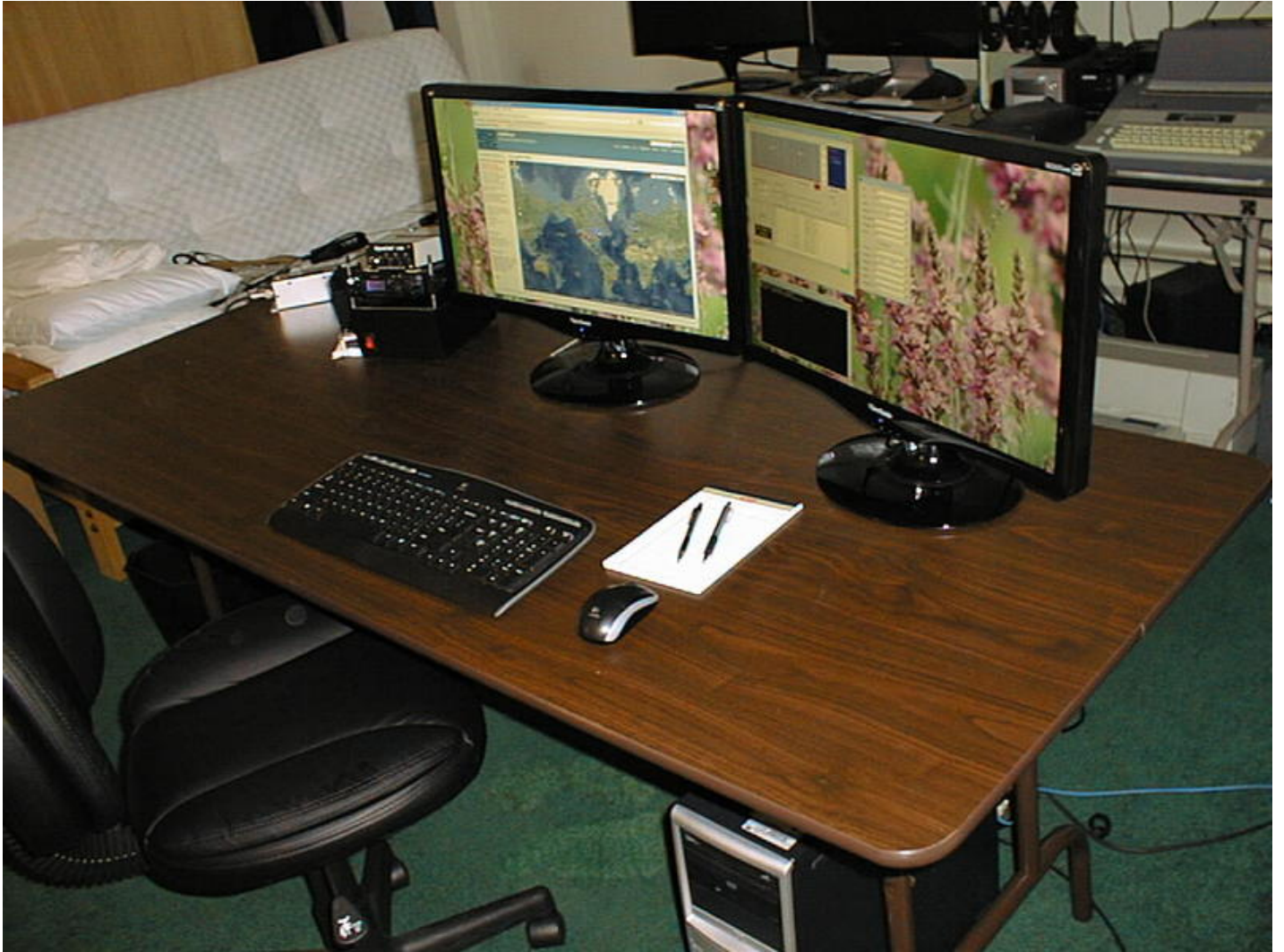
Radio 6 - FT817nd / Signalink USB / Comet CHA250bx 3db loss dummy load vertical / 3.4Ghz HP 7700 computer set up for WSPR on 30 meters