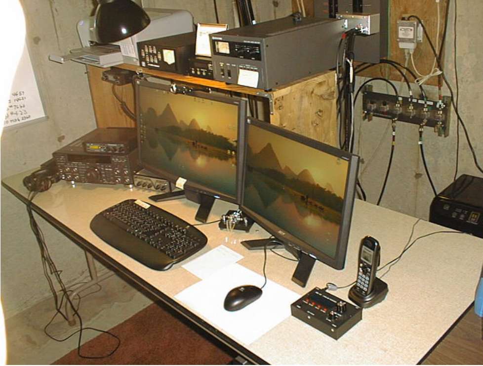
Radio 1 - TS-870s / Navigator interface / 3.2Ghz computer / HRD + DM780 v.5.0 / LDG AT-1000Pro tuner / LP-100A Digital Vector